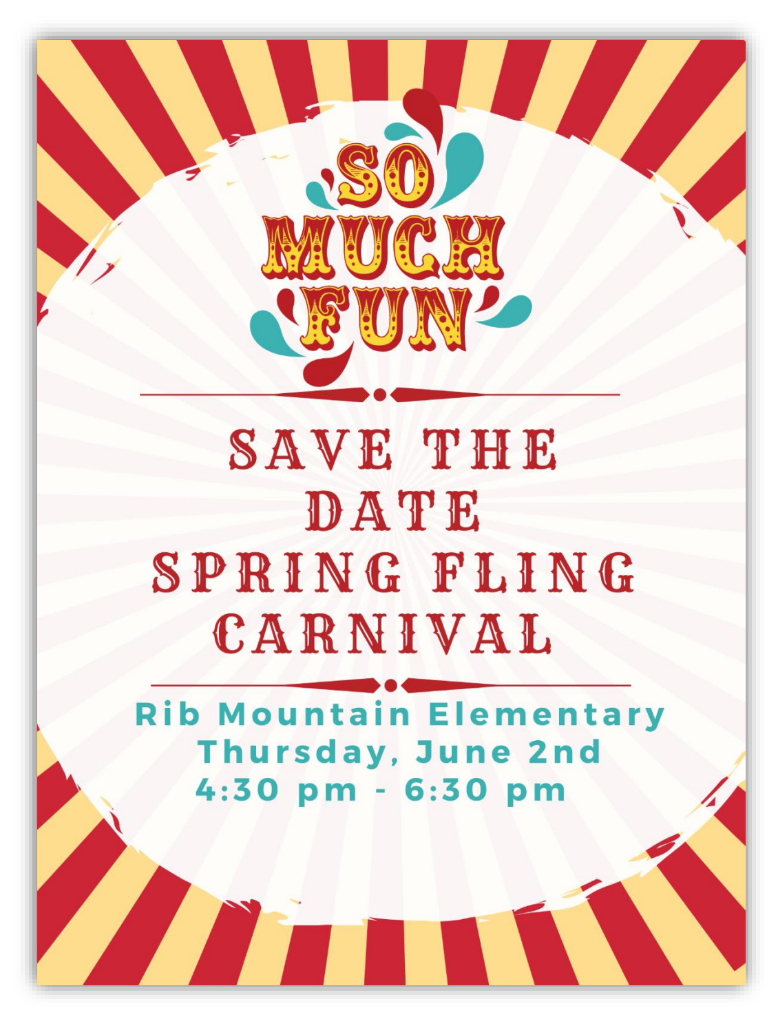
This is a PTO sponsored event

Save the date for the Spring Fling on Thursday, June 2^{nd} from 4:30 pm - 6:30 pm. We have a lot of fun things planned! We hope to see you all there! There will be more details coming soon!